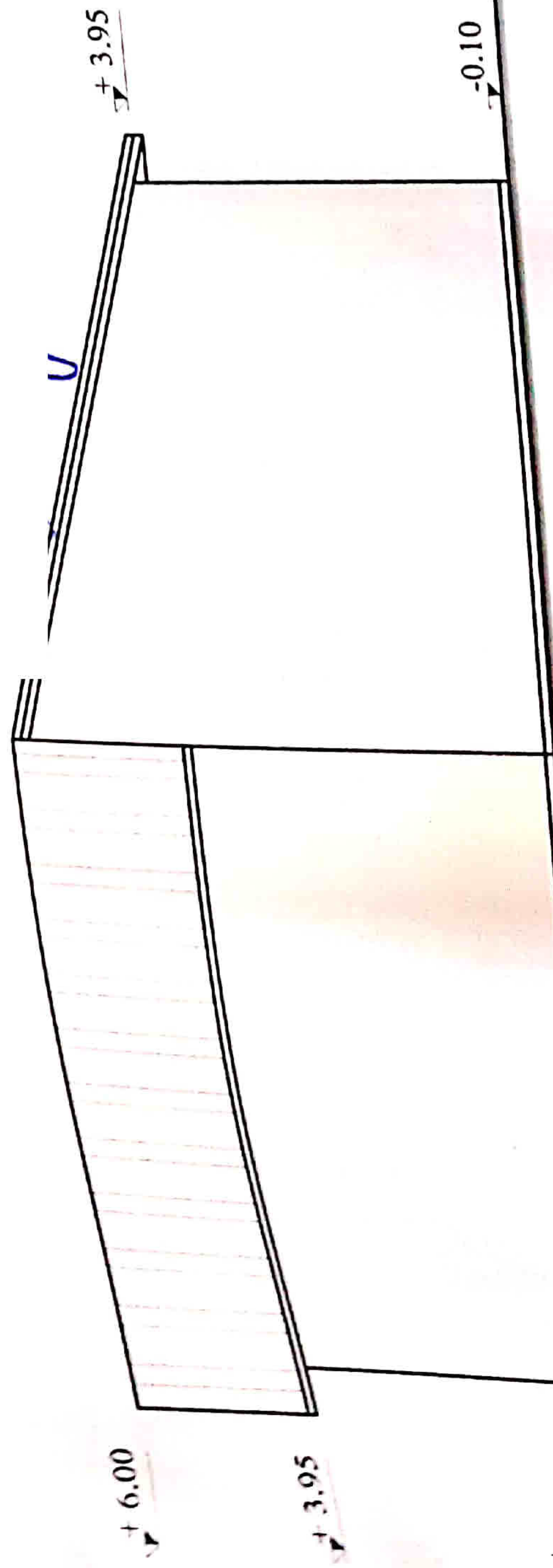
FATADA LATERALA - C8